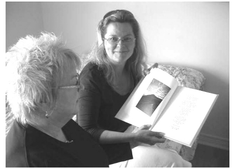
. . . They created a book in her honor. . .